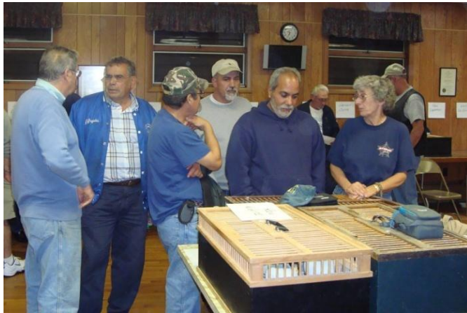
Discussing the entries and their race chances

Thursday's registration was a good time to catch up with old friends in the hotel's hospitality room where there was coffee and pastries served. From there people checked into their spacious hotel rooms and prepared for the evening's events. The men went to the pigeon club to view their race entrants and the shipping of their birds. At the club they had a full buffet dinner and great conversation about their birds, their clubs back home and all the issues facing pigeon fliers today. Old friendships were renewed as well as new ones were made, all with anticipation of the next day's race.