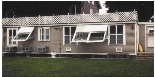
Jim Luiz Loft

The Ladies went to Providence Place on Friday for a day of shopping and site seeing. In the late afternoon they boarded the bus to The Mohegan Sun for an evening of entertainment, gambling and shopping.